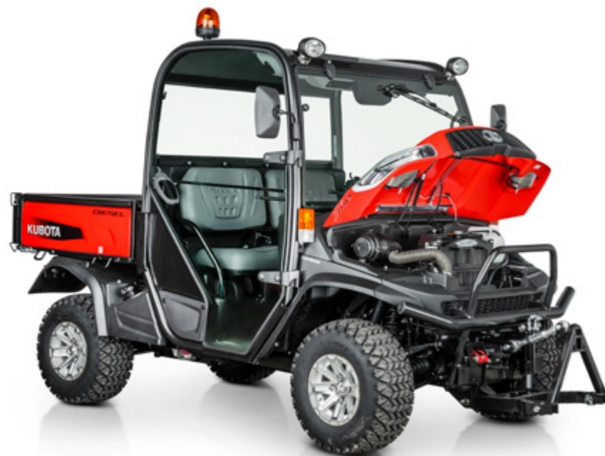
Front-linkage not available in the UK