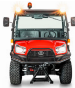
Front-linkage not available in the UK

The machines can be equipped with a front power lift with 500 kg lifting capacity and double-acting hydraulic valve as an optional extra. In addition, you can choose to specify a front cable winch with a pulling force of 1,800 kg. This allows you to literally get things moving.