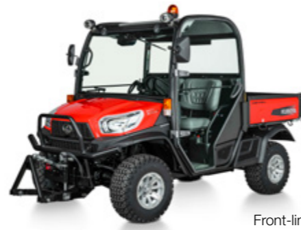
Front-linkage not available in the UK

To enable you to use the RTV X-1110 in the dark, optional work lights are available for the front and rear. This means you can keep everything fully under control, even at night.