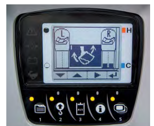
Max. Oil Flow Setting