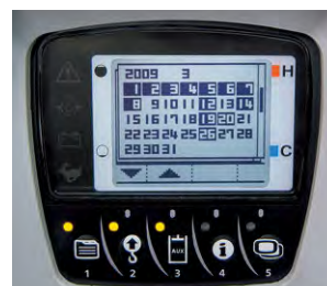
Operation History Record